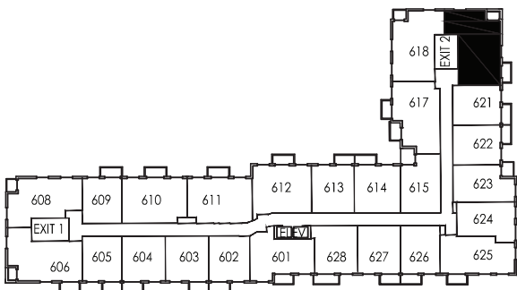
6TH FLOOR KEY PLAN

E. & O.E. Plans and specifications are approximate and are subject to change without notice.