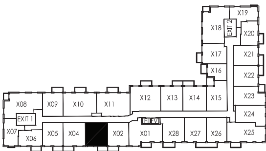
3RD TO 5TH FLOOR KEY PLAN

E. & O.E. Plans and specifications are approximate and are subject to change without notice.