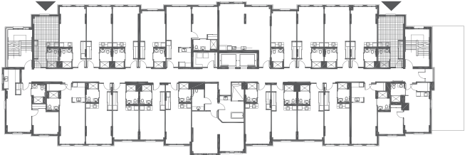
2ND, 3RD, 4TH, 5TH & 6TH FLOOR